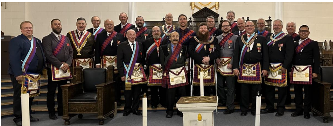
Saskatoon No. 4 Official Visit