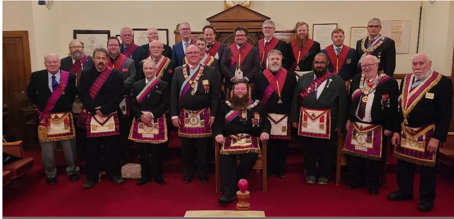
Prince of Wales No. 27 Official Visit