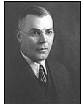
The Honourable William John Patterson 6th Premier of Saskatchewan In office November 1, 1935 – July 10, 1944