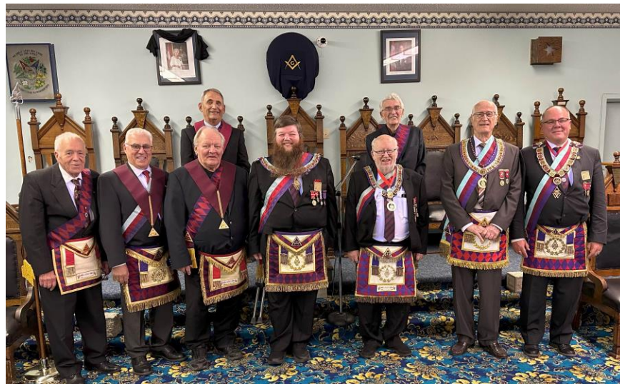
Prince Albert No. 2 Official Visit