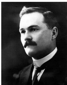
Premier of Saskatchewan – Charles Avery Dunning third premier of Saskatchewan serving from April 5, 1922 – February 26, 1926.

In 1923, the Government of Canada revoked the head tax, a large fee charged to Chinese people entering Canada, replacing it with the Chinese Immigration Act, 1923, which virtually halted all immigration from China. Over the next 24 years, only 44 Chinese migrants entered the country.